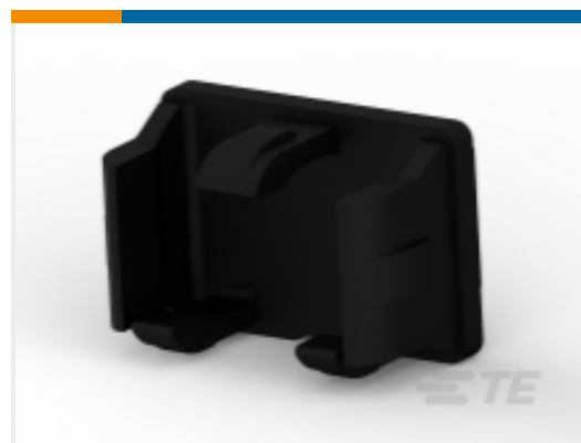
TE Part # 1367147-1 SFP COVER, UNPLATED