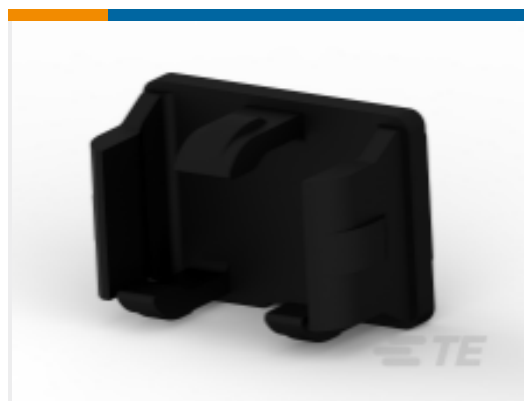
TE Part # 1367147-3 SFP COVER, UNPL, NO LOGO